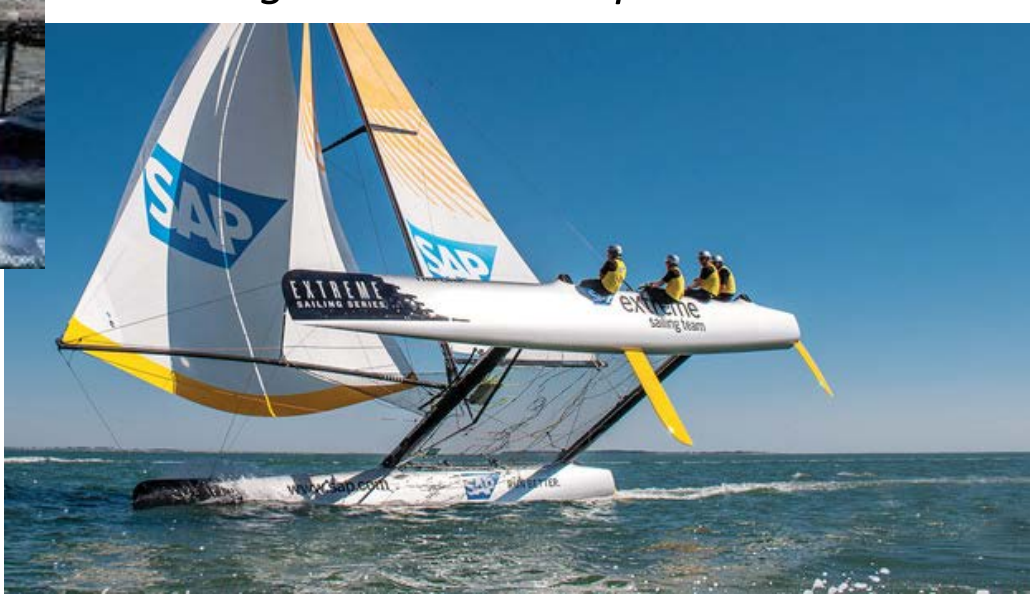
"The thing you notice first is the G-force"